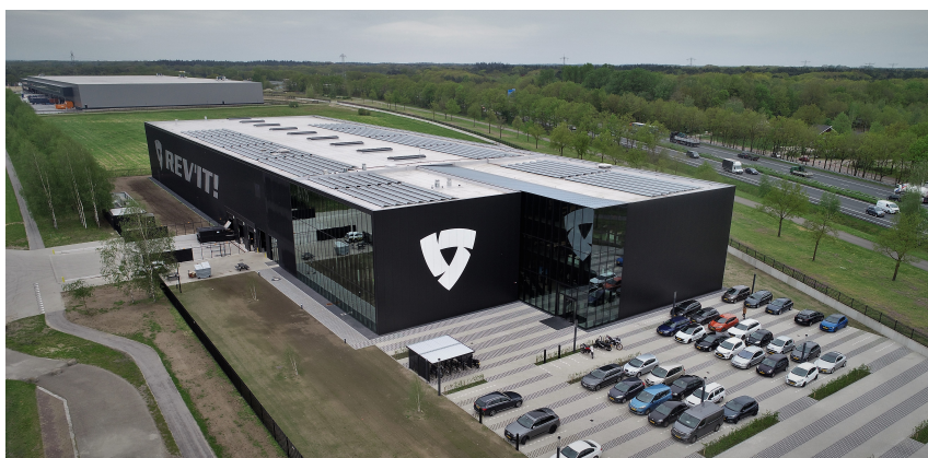
REV'IT!'s new centralized European DC in Oss has been specially designed to facilitate the motorcycle clothing producer's growth ambitions.

"However, the situation in Oss was becoming increasingly challenging due to our continued success," explains the managing director. "Our operation was spread across three buildings, which created lots of process inefficiencies – both in the offices and in the warehouses. For example, we had two order-picking locations which meant that we had to continuously manage the staffing levels. And sometimes orders were split and sent to our dealers as part deliveries. In other words, it was high time for us to find a new home."