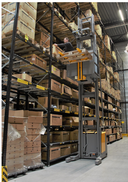
In the new facility, products can be stored and picked at a height of up to 13 meters.