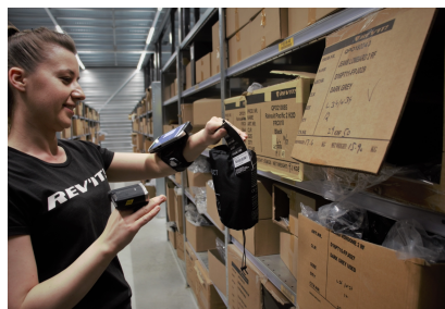
Because orders are no longer split the company has reduced its transport costs, among other things.