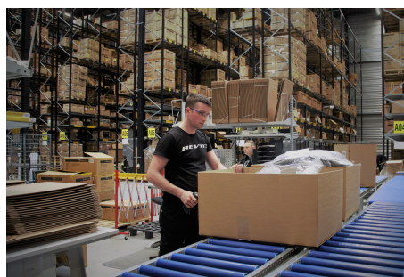
Thanks to the optimally streamlined logistics processes in the new EDC, REV'IT! has been able to make substantial efficiency gains.